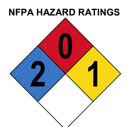
Chemical not listed. Ratings based on NFPA guidelines